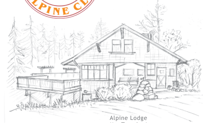
Alpine Lodge Mt. Tamalpais

CAC lodges are maintained and operated by the membership. In order to keep our low, co-op prices, members are expected to contribute to Club operations at least once a year. Alpine Lodge holds mid-week and Sunday work parties; Echo Lodge accommodates bi-annual, multi-day "fun and work" parties. To coordinate a major Club event, host at Echo Lodge, cook a large dinner, coordinate the clean-up for Club events at Alpine Lodge, edit our TRAILS newsletter, proofread CAC documents, fill a leadership position, join a committee, or organize a wilderness hike or camp-out are just some of the other ways to satisfy this annual work obligation.