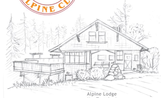
Alpine Lodge Mt. Tamalpais

CAC lodges are maintained and operated by the membership. In order to keep our low, co-op prices, members are expected to contribute to Club operations at least once a year. Alpine Lodge holds mid-week and Sunday work parties; Echo Lodge accommodates bi-annual, multi-day "fun and work" parties. To coordinate a major Club event, host at Echo Lodge, cook a large dinner, coordinate the clean-up for Club events at Alpine Lodge, edit our TRAILS newsletter, proofread CAC documents, fill a leadership position, join a committee, or organize a wilderness hike or camp-out are just some of the other ways to satisfy this annual work obligation.