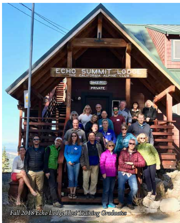
Fall 2018 Echo Lodge Host Training Graduates