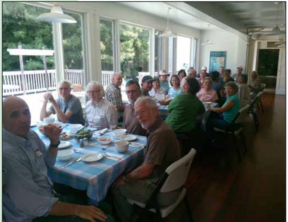
Work Party Photo caption - 29 Eager Volunteers Attend Work Party