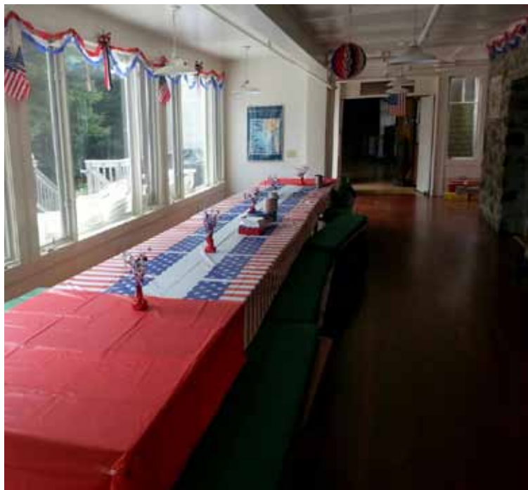
Fourth of July at Alpine Lodge

FIRST CLASS US POSTAGE PAID PERMIT #470 SANTA ROSA CA