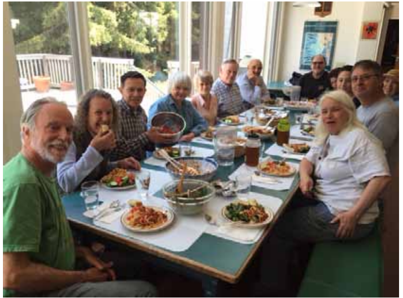
Much done, Thanks to all! And we ate very well!