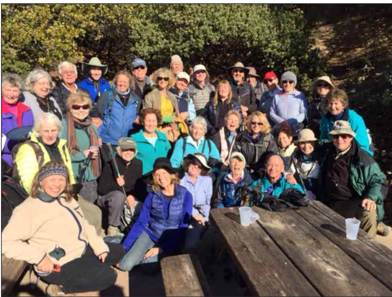
Members celebrating another New Year's Day with champagne atop Mt. Tam