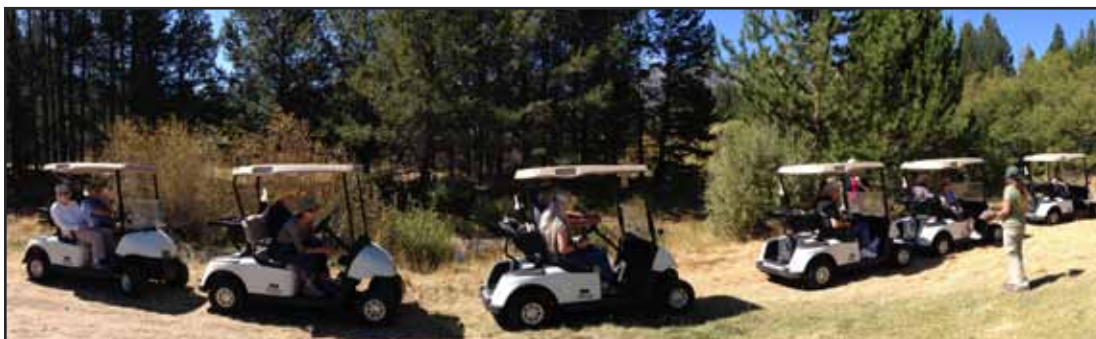
Group on cart tour of Upper Truckee River restoration project in the golf course area