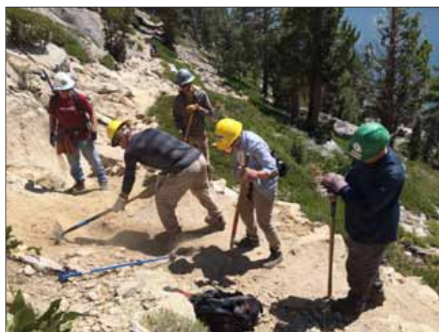
Members of CAC, PCTA and TRTA jointly working on the Pacific Crest Trail.

Most of the Tahoe Rim Trail members live in the Tahoe basin and arrived on Saturday morning. It was a good thing that I made a lot of food for breakfast! With over 30 volunteers the dining room was quite a scene! The USFS representative then took us out to the parking lot for safety training. This