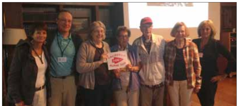
CAC members who attended the FWOC conference this year.