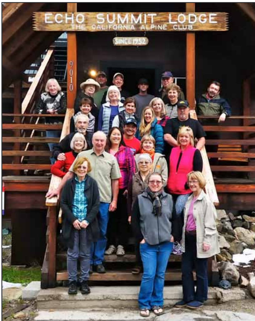
Spring 2015 Echo Lodge Host Appreciation and Training Group