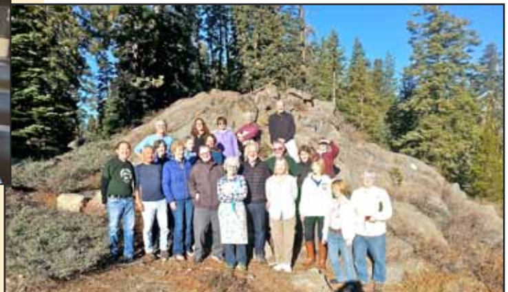
Echo Lodge Host Training Fall 2014