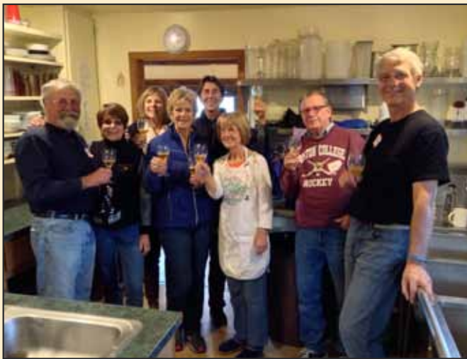
Tasting Echo Double IPA Beer