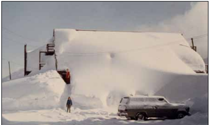
"45 Years Ago - Echo Summit Lodge Buried in Snow - Verna West and Audrey West"