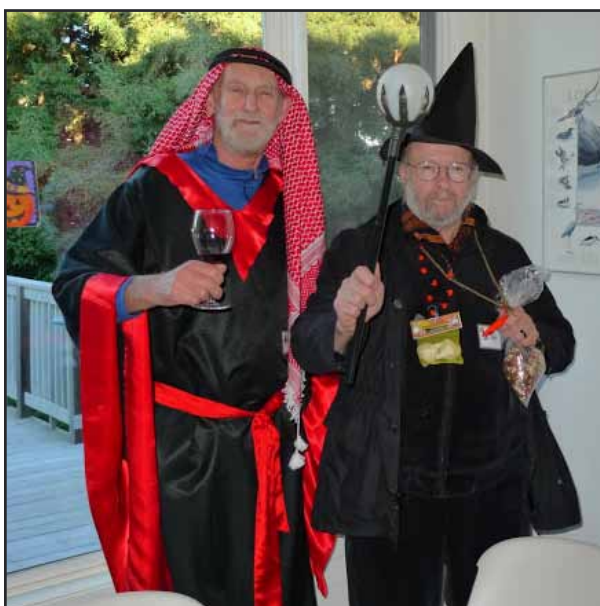
2013 Halloween Party Merry-makers