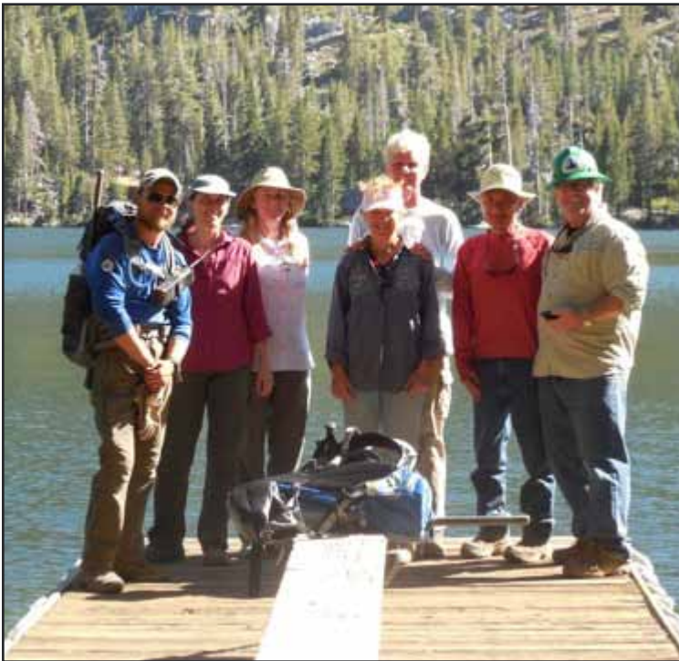
Waiting for the water taxi