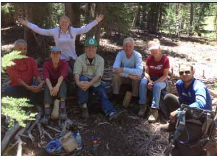
Time for a rest