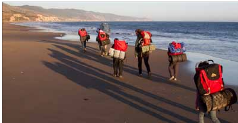
The CAC Foundation has supported the Clem Miller Environmental Education Center summer camp at Pt. Reyes for the past four years with grants to purchase equipment such as tarps, backpacks, water bottles and sleeping bags. Here, backpackers walk along Limantour Beach at sunset.

Fall Music and Wine Fundraiser for the CAC Foundation Watch for details in upcoming Trails !