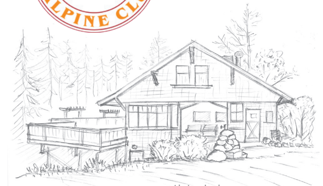
Alpine Lodge Mt. Tamalpais

CAC lodges are maintained and operated by the membership. In order to keep our low, co-op prices, members are expected to contribute to Club operations at least once a year. Alpine Lodge holds mid-week and Sunday work parties; Echo Lodge accommodates bi-annual, multi-day "fun and work" parties. To coordinate a major Club event, host at Echo Lodge, cook a large dinner, coordinate the clean-up for Club events at Alpine Lodge, edit our TRAILS newsletter, proofread CAC documents, fill a leadership position, join a committee, or organize a wilderness hike or camp-out are just some of the other ways to satisfy this annual work obligation.