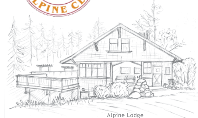
Alpine Lodge Mt. Tamalpais

CAC lodges are maintained and operated by the membership. In order to keep our low, co-op prices, Members are expected to contribute to Club operations at least once a year. Alpine Lodge holds mid-week and Sunday work parties; Echo Lodge throws bi-annual, multi-day "fun and work" parties. To coordinate a major Club event, host at Echo Lodge, cook a large dinner, coordinate the clean-up for Club events at Alpine Lodge, edit our TRAILS newsletter, proofread CAC documents, fulfill a leadership position, join a committee, and organize a wilderness hike or camp-out are just some of the other ways to satisfy this annual work obligation.