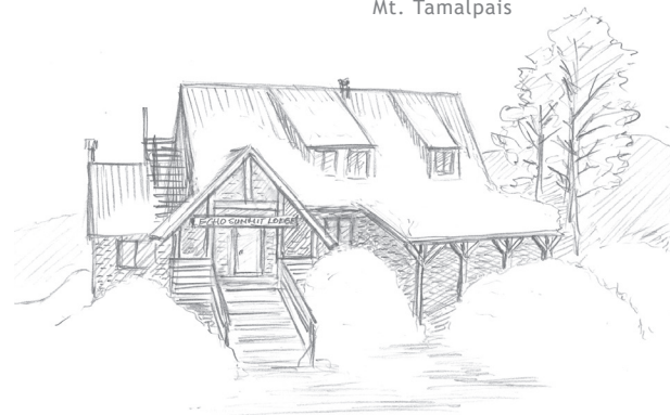
Echo Summit Lodge Lake Tahoe