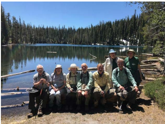
After photo taken, group in unison: "What?!? Five more miles to go? "