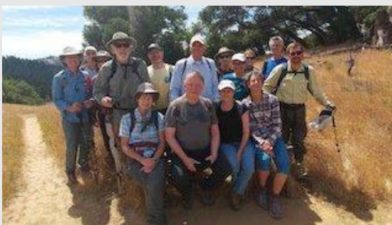
Another group of Happy Hikers