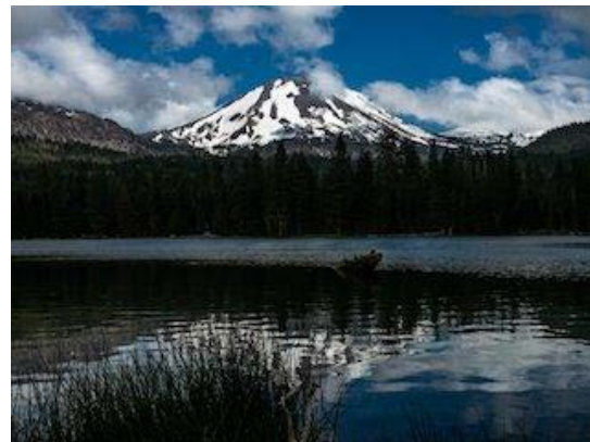
Evening view of Manzanita Lake