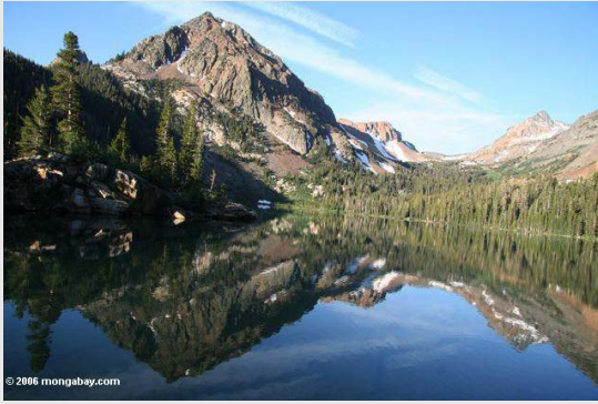
Green Lake - Eastern Sierras