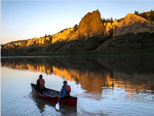
Upper Missouri River, Montana